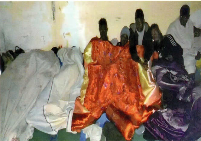
One group sleeping on the street before our help

Africa is increasingly unsafe for LGBTQIA+ individuals. They seek refuge in cities like Dakar. Forced to live in concealment until they get through the refugee system to a safe country, they are prohibited from working but still require funds for essentials like food and shelter. Join us in supporting them.